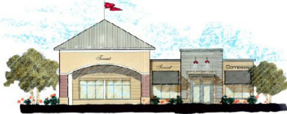
BISHOP ROAD ELEVATION (EAST) SCALE: 1/8" = 1'-0"