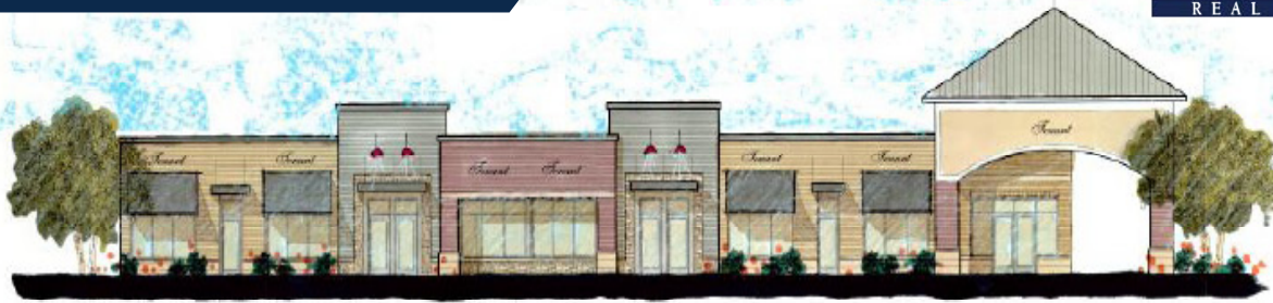
EDDY ROAD ELEVATION (NORTH) SCALE 1/8" = 1'-0"