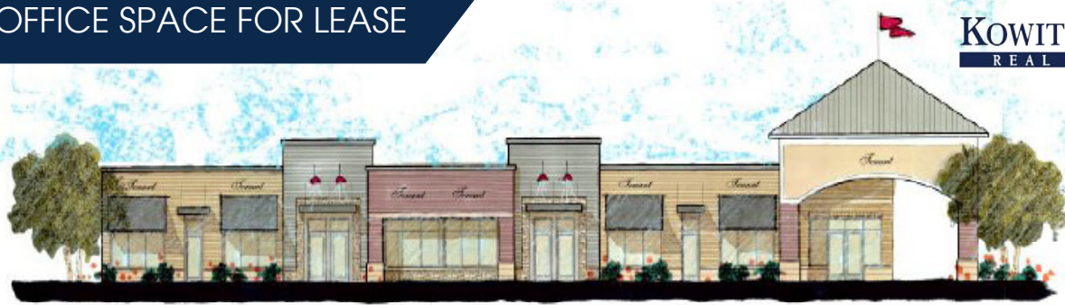
EDDY ROAD ELEVATION (NORTH) SCALE 1/8" = 1'-0"